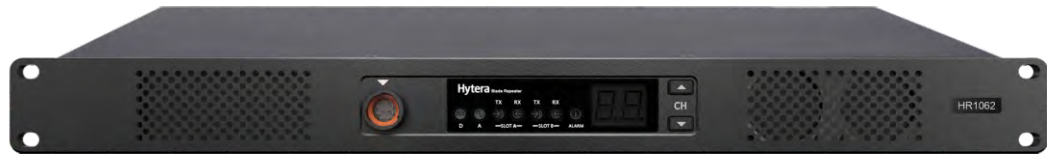
HR1062 Rack-Mount Repeater

Hytera repeaters are available as professional network equipment that can be installed in a standard 19" rack typically found in a data closet, and as compact repeaters that have integrated antennas for applications for use in tight spaces. Compact repeaters can also support portable applications with integrated battery packs for carrying the repeater in mobile applications.