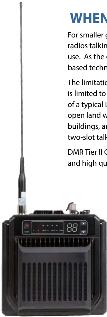
HR652 Compact Repeater

DMR Tier II Conventional Repeater systems are deployed to when the limited range, growing number of users, and high quantity of calls on radio-to-radio systems are limiting the organization's communications capacity.