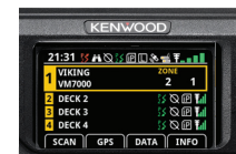
Night - High Contrast